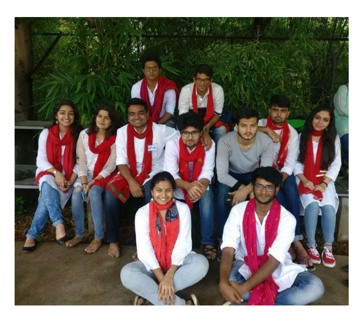
SLS PUNE'S DRAMA CONTINGENT TO CHRIST UNIVERSITY, PUNE, HELD IN SEPTEMBER 2017