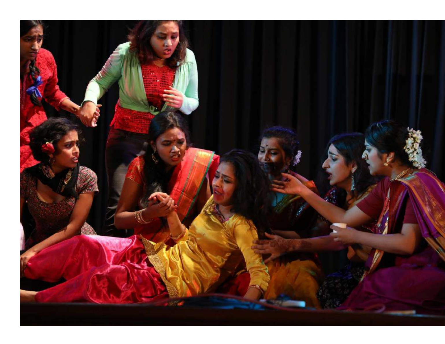
LAW THEATRE 2018