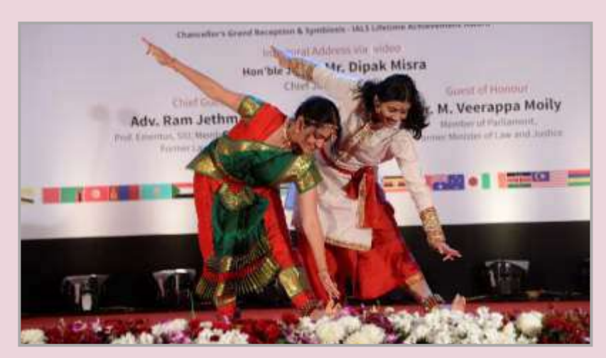
Opening dance at the inaugural ceremony of Global Law Deans' Conference