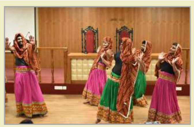
Puppet Dance by First Year Students