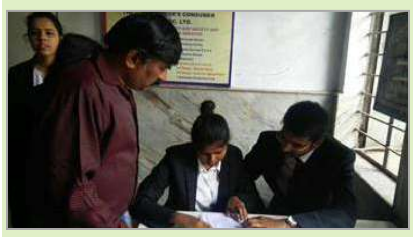
Symbiosis students assisting the help desk visiting the PDLSA on the day of the National Lok Adalat to reach their court