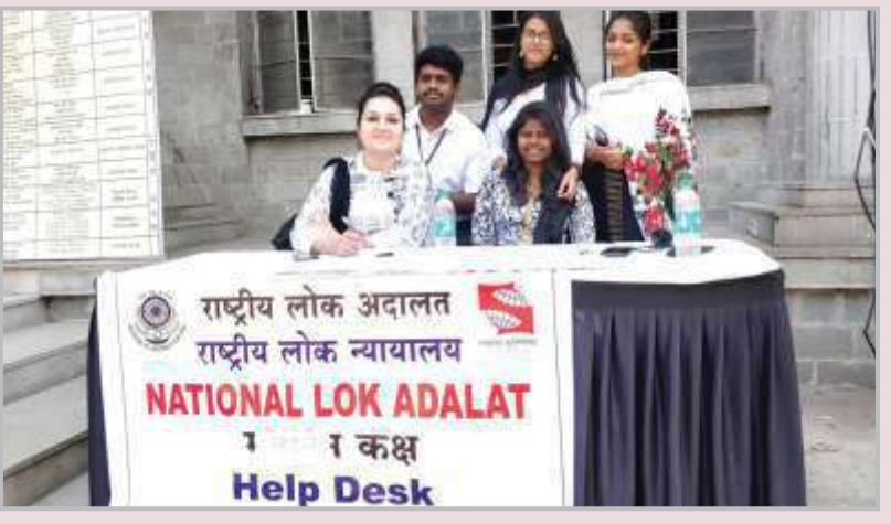
Students of SLS-P at the National Lok Adalat