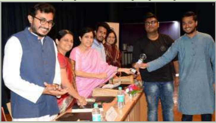
Winning team from Gujarat National Law University, Gandhinagar receiving the trophy

The students were oriented on different carrier avenues by the experts. There were also talks on 'Health and Wellness Issues' by Symbiosis Recreation & Wellness Centre, SCHC and 'Waste Management' by Symbiosis Centre for Waste Resource Management.