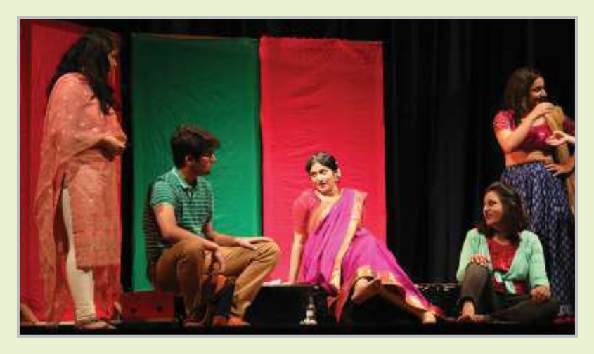
'The Fallen Beauty' – the Law Theatre at the Inaugural Ceremony of Symbhav 2018