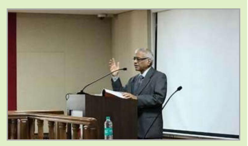
Justice J. A. Patil, Former Judge, Bombay High Court