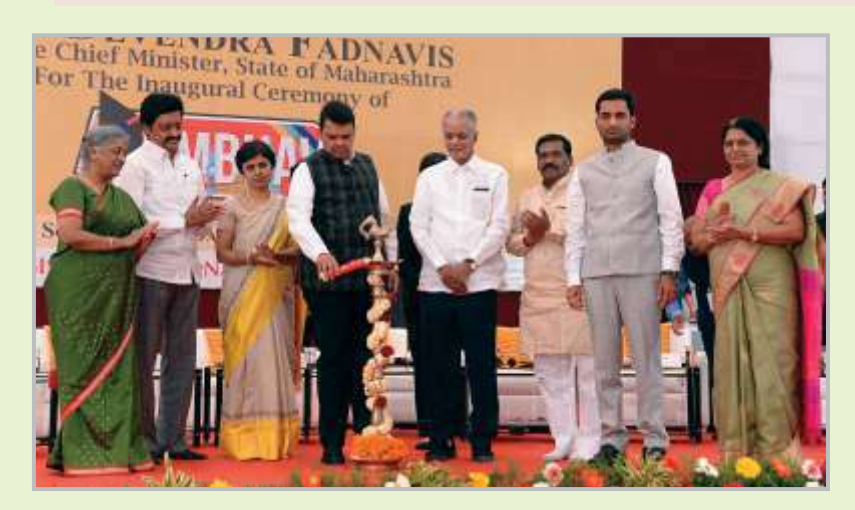
Lighting of the Lamp by Shri Devendra Fadnavis, Hon'ble Chief Minister, Maharashtra at the inauguration of 10th edition of Symbhav, 2018