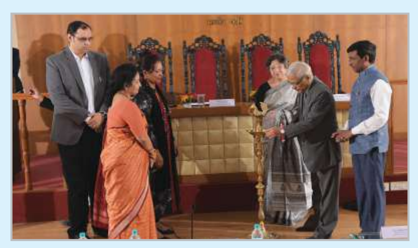
Lighting of the Lamp by Dignitaries at Nani A. Palkhivala Memorial Inter-Collegiate Elocution Competition