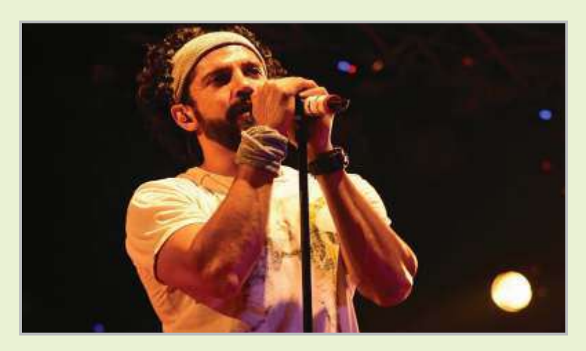
Symbhav, 2018 witnessed an electrifying performance by Farhan Akhtar Live which sent the spirits soaring

Theme for the decennial celebration, 'Global Village', truly encapsulated the principle of Vasudhaiva Kutumbakam, the foundation on which Symbiosis as an institution stands. The cultural fest- inaugurated at the hands of Shri Devendra Fadnavis, Hon'ble Chief Minister, Maharashtra as the Chief Guest on 21st February - gathered momentum with a spectacular opening dance followed by 'The Fallen Beauty', a dramatization of Budhadev Karmaskar Vs. State of West Bengal (2011) case. The play addressed issues pertaining to sex workers and the violation of their human rights.