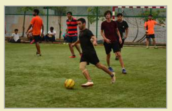
Football Tournament at Symptoms '17