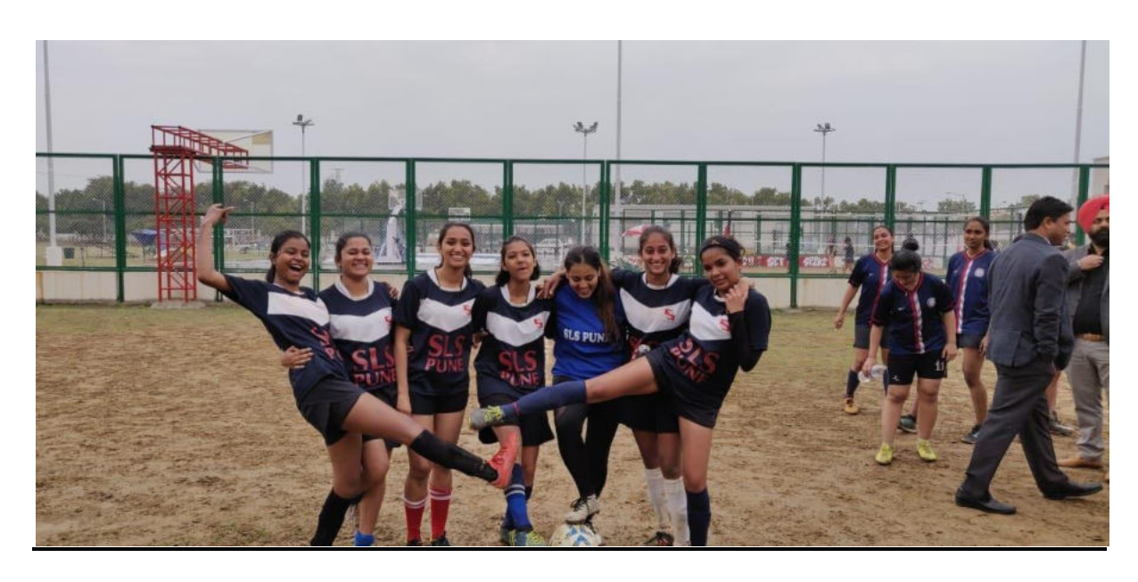
Girls football team for Zelus' 2019