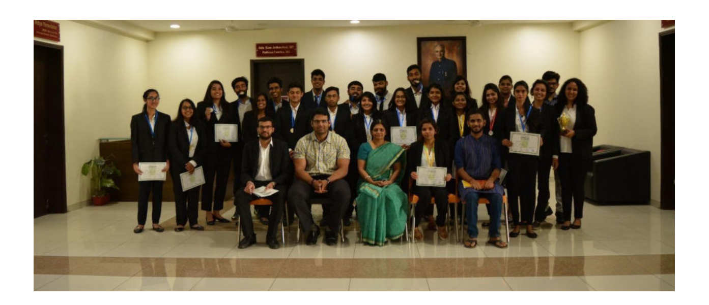
SLS-P showed remarkable sportsman spirit in SPIRITUS'18, the annual collegiate fest of NLSIU Bangalore, by bagging the second-Best Contingent award