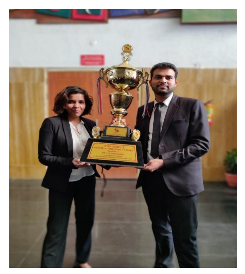
SLS – P has emerged as the Inter-Institute Overall Championship Winner.