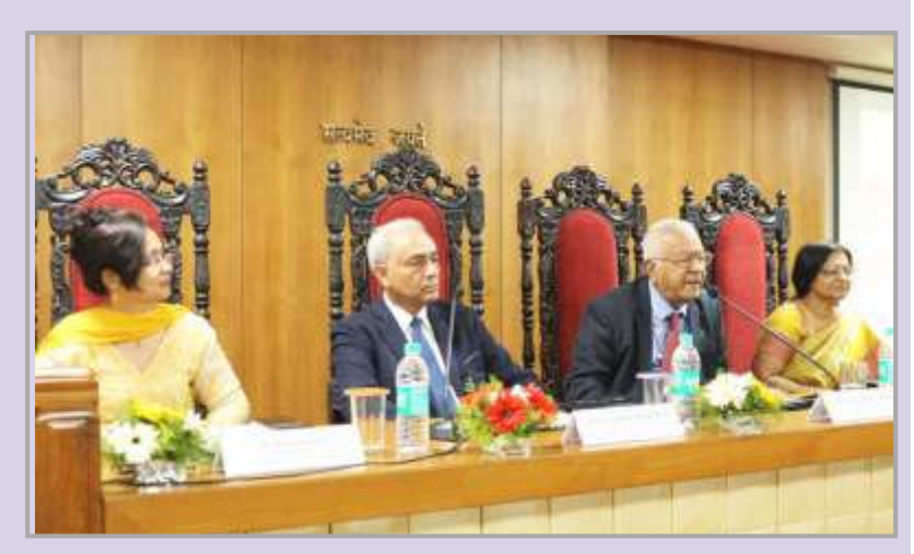
Panel for the Opening Ceremony of SICTA 2019