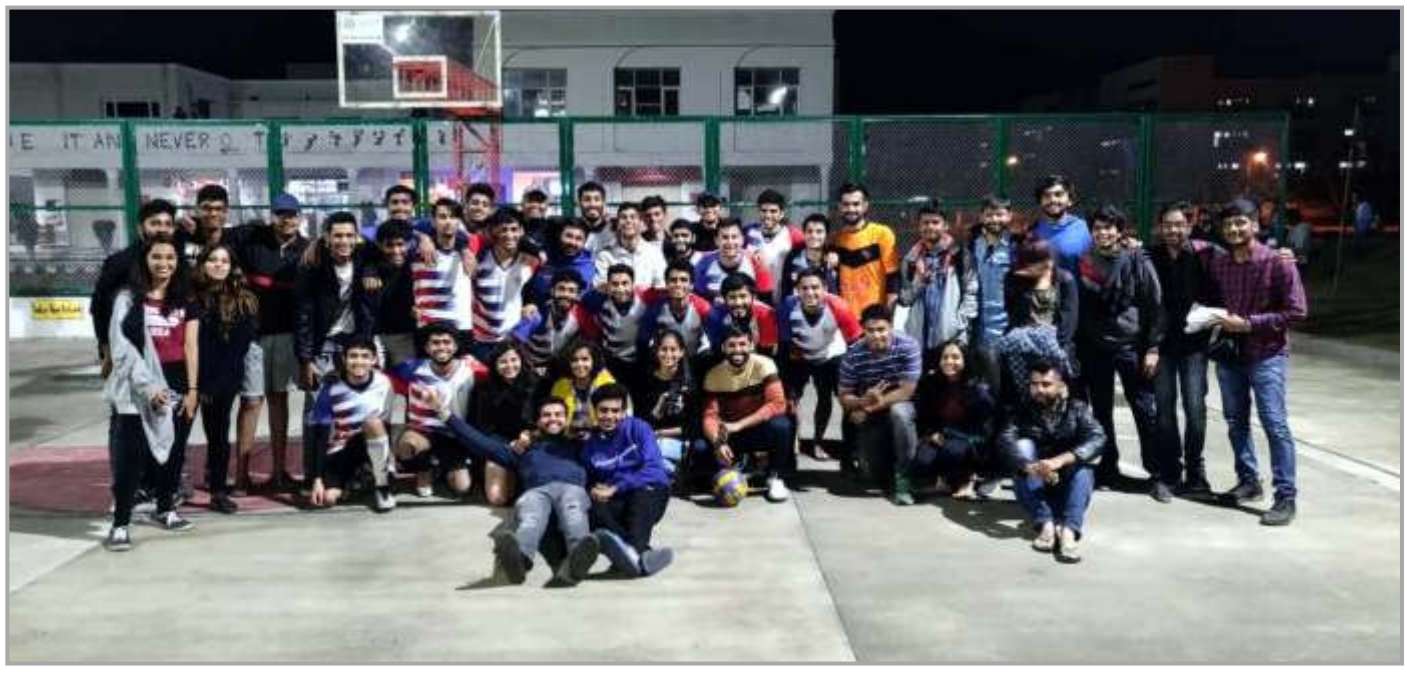
SLS Pune Sports Contingent.