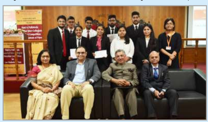
Participants of the Nani A. Palkhivala Memorial Inter-Collegiate Elocution Competition