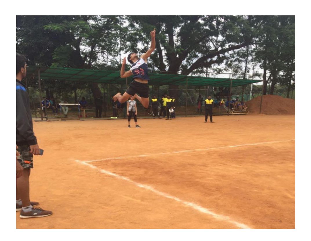
The Volleyball Men in action