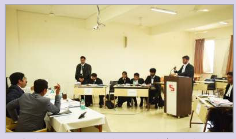
Participants advancing their arguments before the judges

Panel for the Opening Ceremony of SICTA 2019The Fourth Edition of the Symbiosis Law School, Pune, International Criminal Trial Advocacy Competition (SICTA) was held from 28th March to 30th March 2019. The three-day competition hosted teams from 24 law schools including 2 foreign law schools namely, University of Bristol, UK and Nepal Law Campus, Nepal.