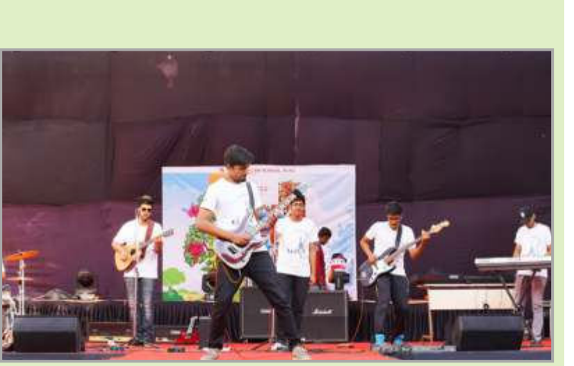
Battle of the Bands

The opening ceremony began with a spectacular dance performance based on Women Empowerment. It was followed by the play "Mere Hisse Ki Dhoop", based on the real-life tragic events of Rohingya refugees in India, brought to public attention by the judicial precedent of Lian Khan v Union of India.