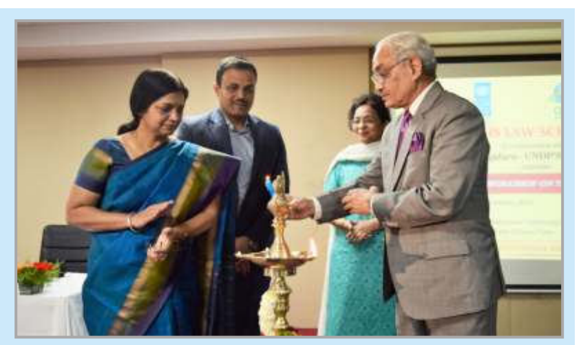
Inauguration of the Regional Workshop on Biodiversity