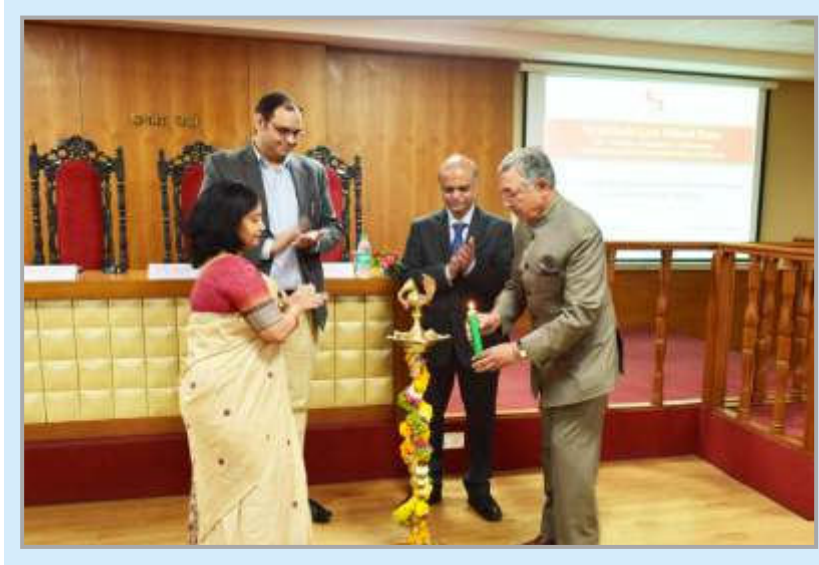
Inauguration of the Nani A. Palkhivala Memorial Inter-Collegiate Elocution Competition