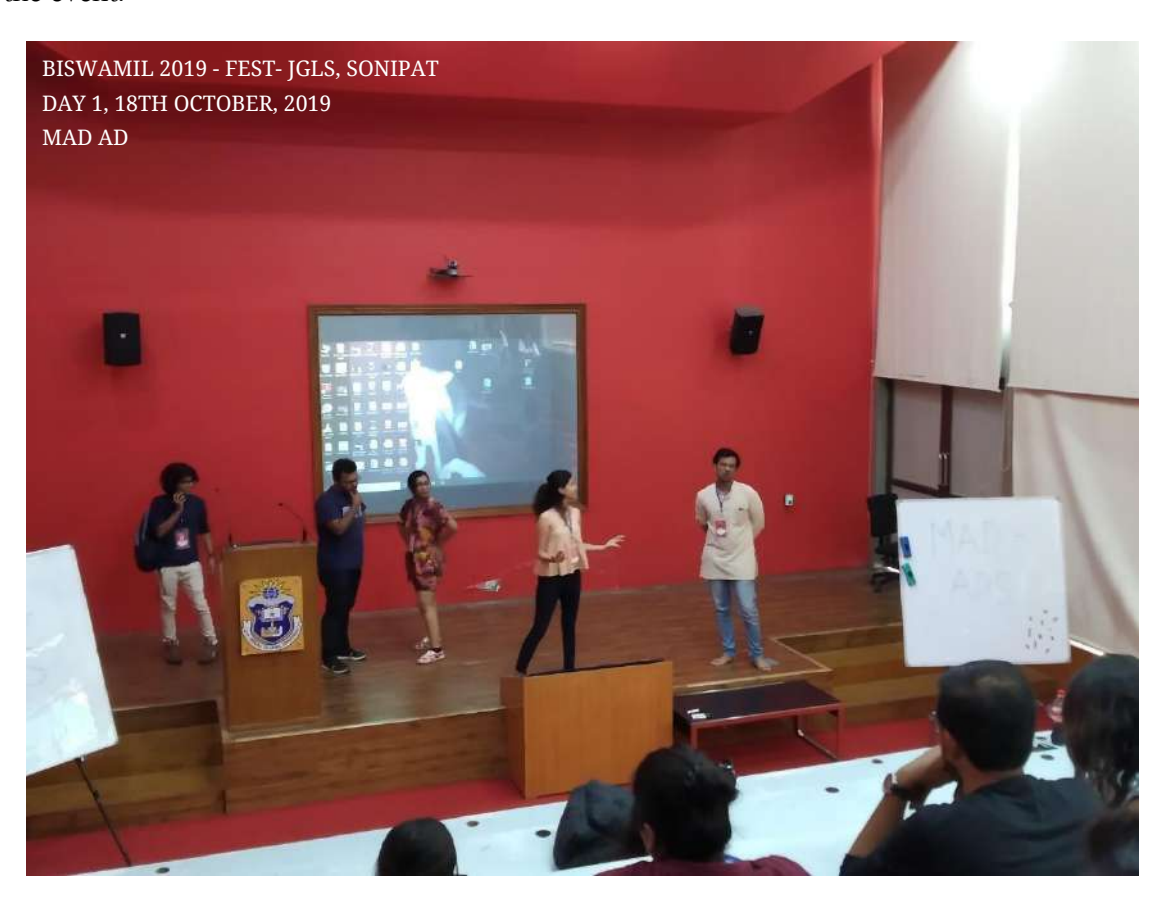
Team No. 1 performing their 'Mad Ad'

The topic they were allotted for the Mad Ads were Hair wigs and Hand Cuffs. A total of 13 teams participated in the event. Both the teams performed exceptionally, and jointly fetched 2<sup>nd</sup> position in the event.