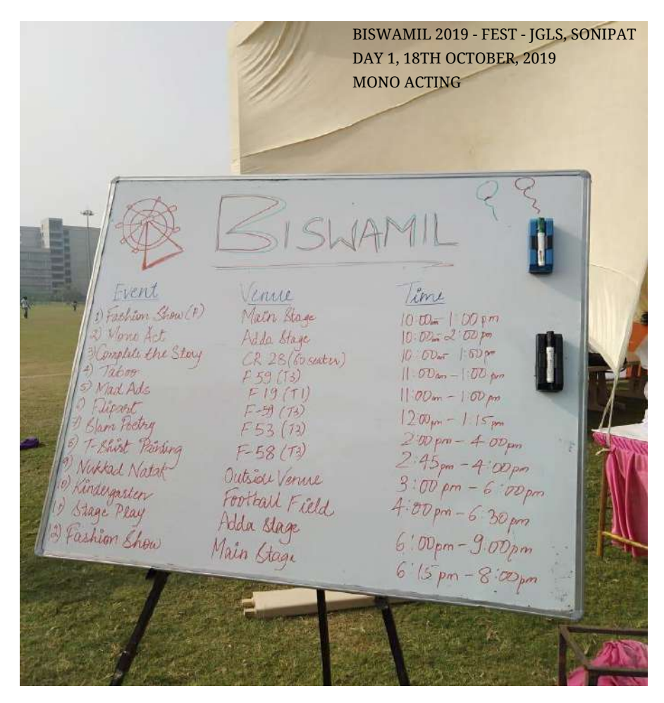
The Events lined-up for Day 1

9:45 a.m. - Student assemble at JGU's football ground to register themselves for various events. Every student had to individually verify their identity and subsequently follow-up with the events that they were to participate in. Last minute registrations were permitted by JGU. The registration continued for around 40 minutes and the students dispersed for their respective events scheduled at various locations around the campus.