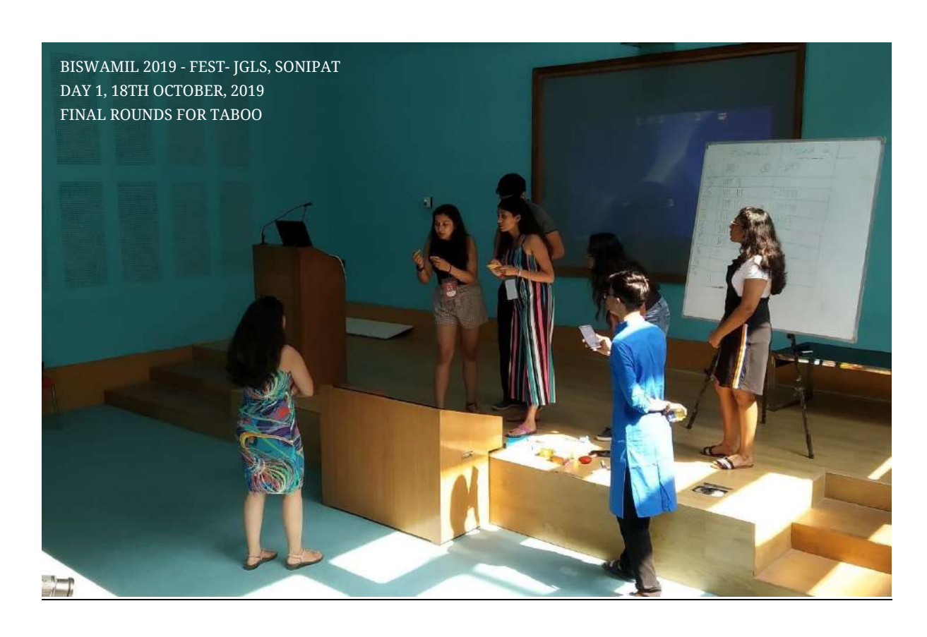
Final Rounds for Taboo