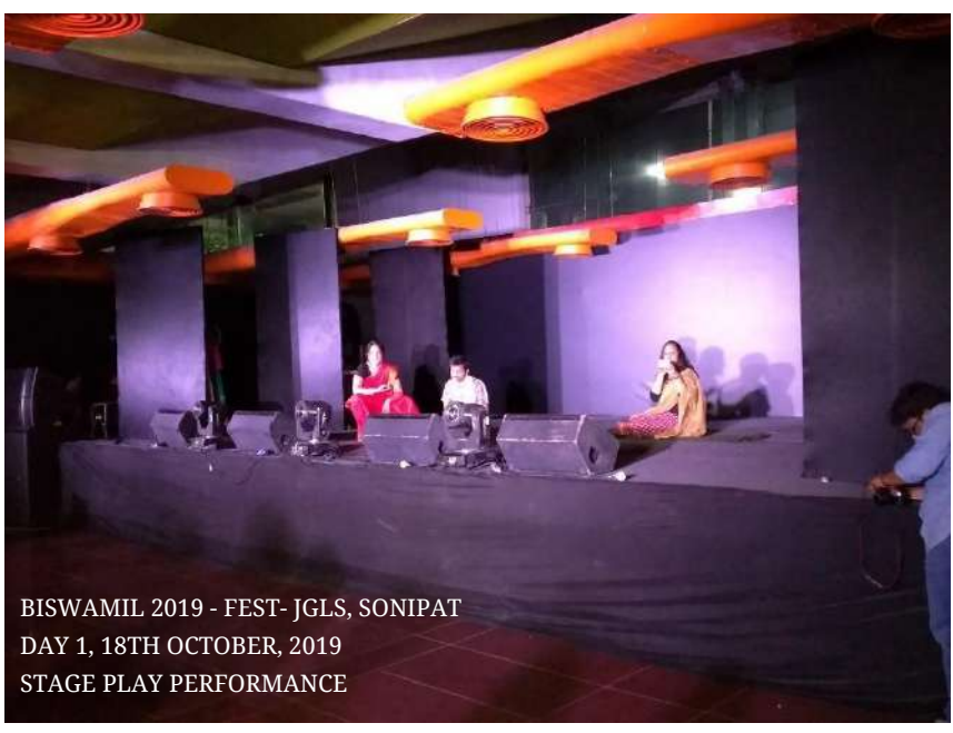
A few glimpses from the Stage Play performances