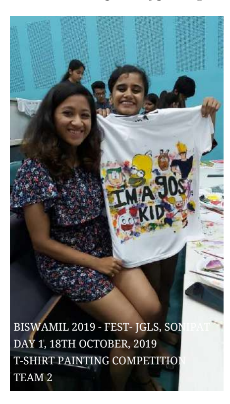
Team No. 2 with their painted T-Shirt