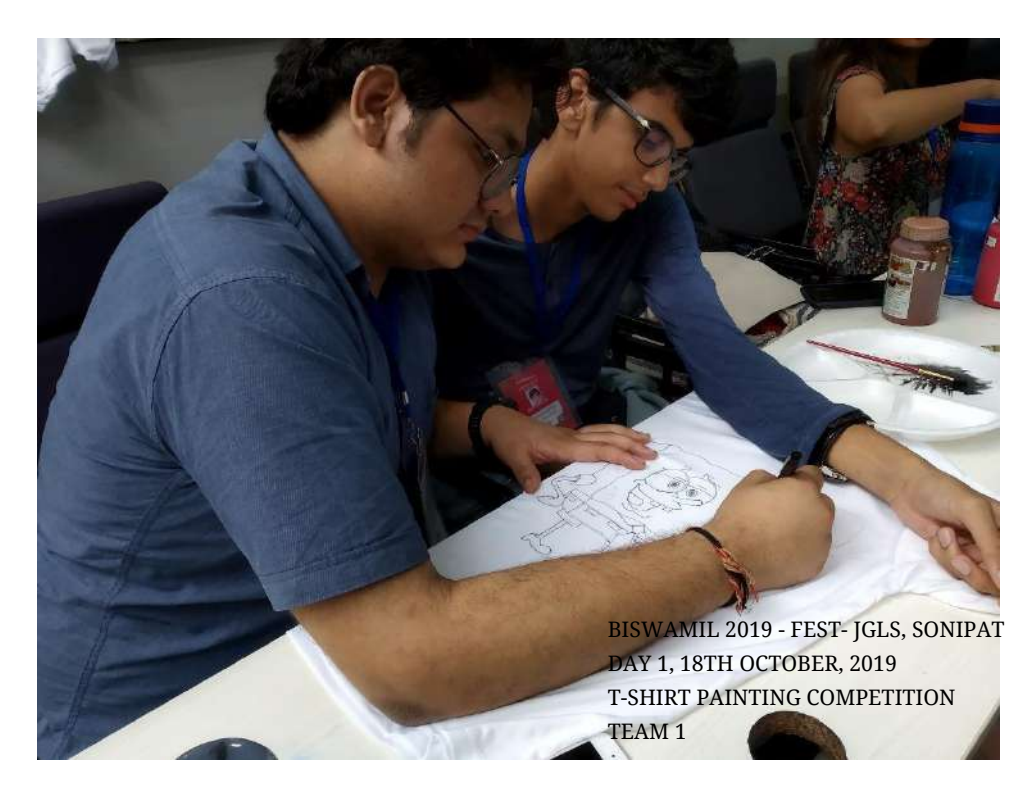
Team No. 1 in the process of painting their T-Shirt