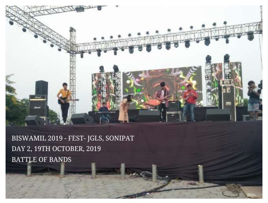
The SLS Team performing Battle of Bands

from IIIT Delhi, Bennett University, VIT etc were also present. It was a privilege for SLS to defeat all of these teams and ace the performance.