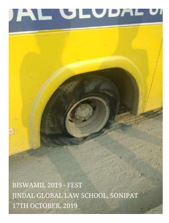
The broken down shuttle bus provided by JGLS

4:40 pm - The 'Third' bus arrived at around and we finally left for Jindal. The cherry on top was the loading and unloading of luggage every time we had to switch buses.