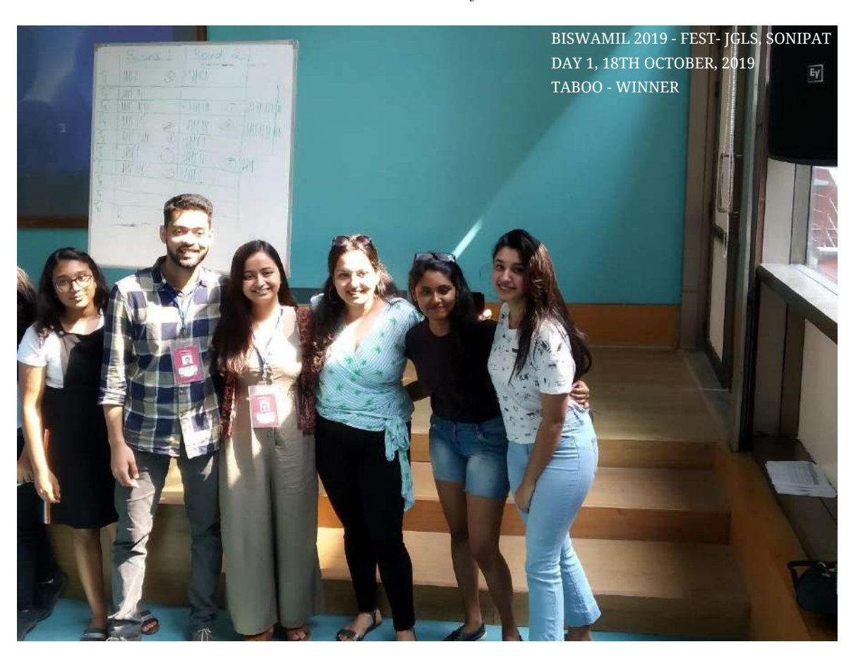
The winning team with the organisers of Taboo from JGU