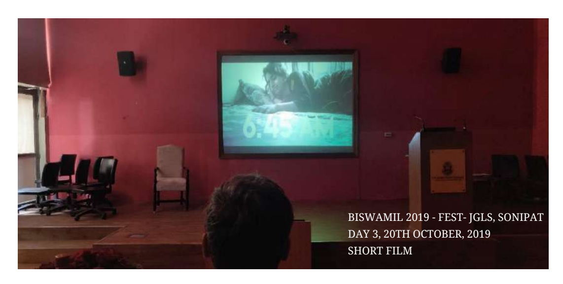
Screening of the Short Film submitted by SLS