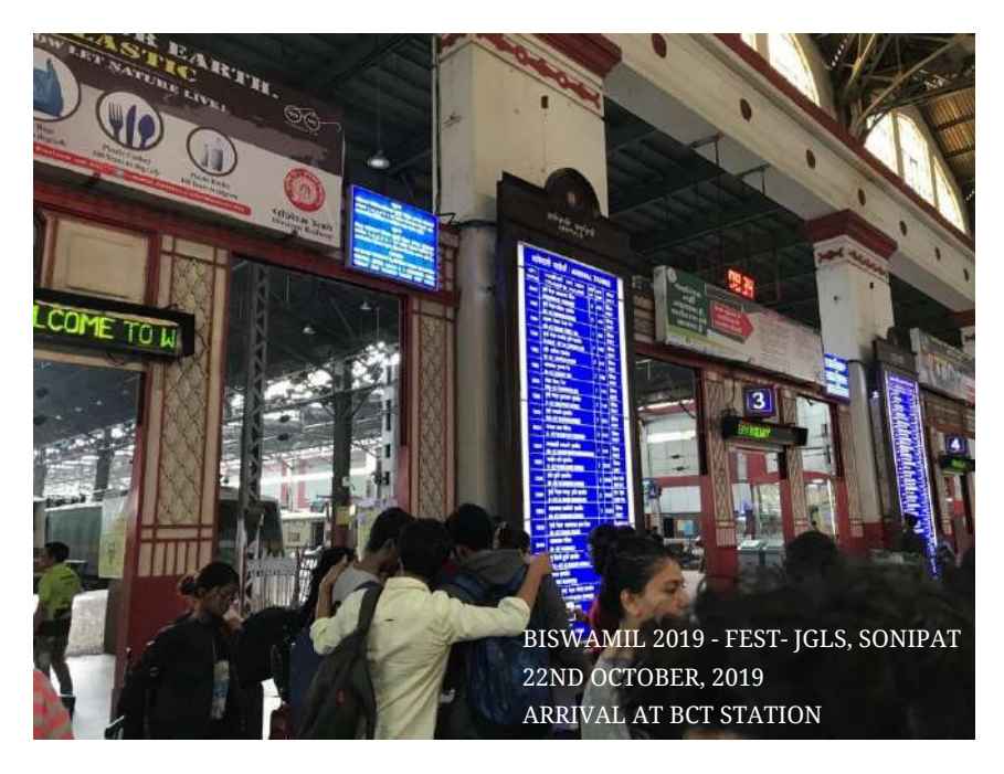
The Contingent after their arrival at the Mumbai Central Station, at 08:34 am

8:15 am - The train arrived in Mumbai and a bus was sent by Symbiosis which also arrived on time. Everybody bought snacks to gear themselves up for the long journey from Mumbai to Pune. The surprise was that it was an AC bus, and everybody comfortably settled in and left within ten minutes. The scenery on the Mumbai Pune highway was worth the watch too.