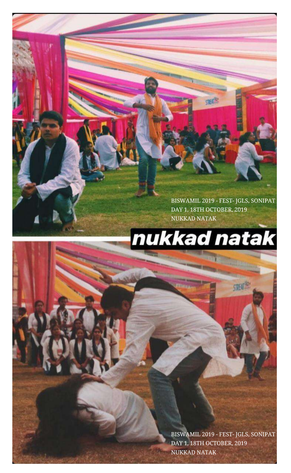
The Social Media coverage given to SLS's team by JGU