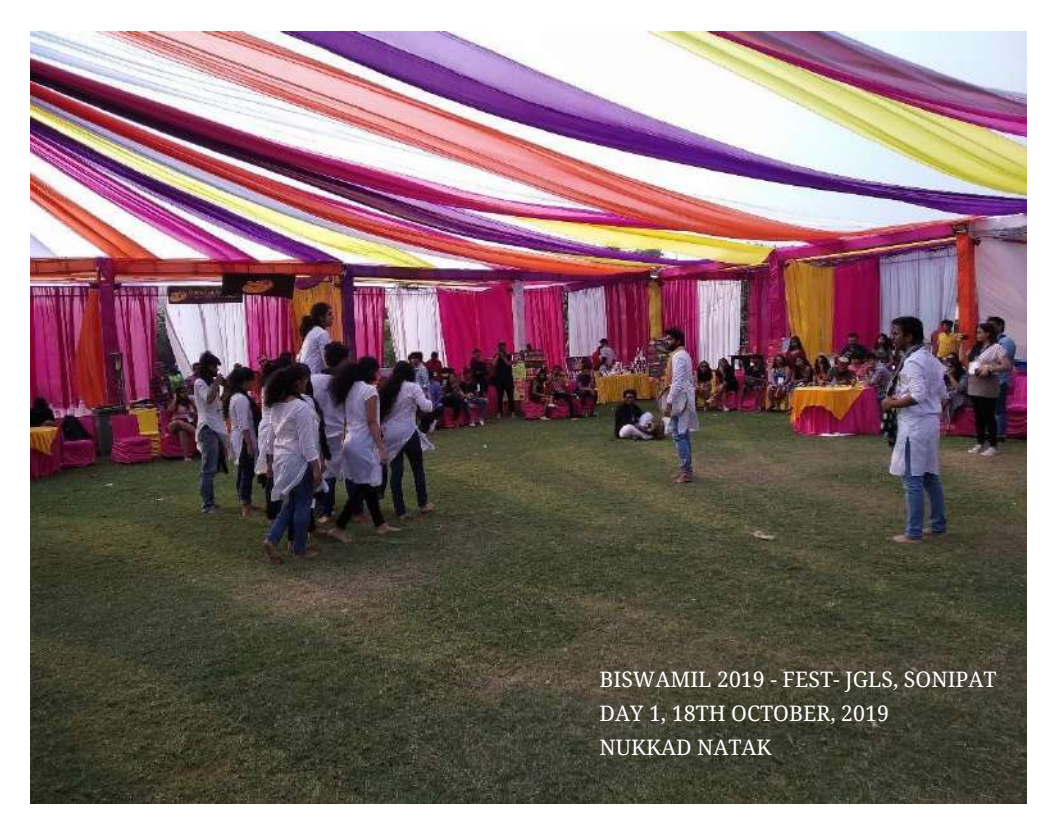
The Team performing Nukkad Natak

The Title of the play was 'Kalyug ka Kans Kon', which covered and comprised of 4 Themes, namely-Foeticide, Racism, Domestic Violence and Casteism. The audience thoroughly enjoyed their performance and the team received widespread response and appreciation from everyone present at the event. They received a special mention for their performance.