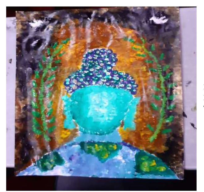
BISWAMIL 2019 - FEST- JGLS, SONIPAT DAY 2, 19TH OCTOBER, 2019 THUMB PAINTING