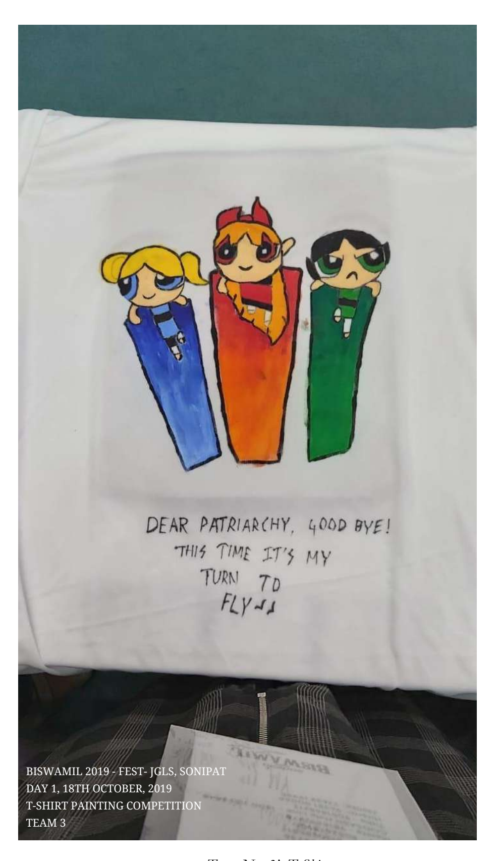
Team No. 3's T-Shirt