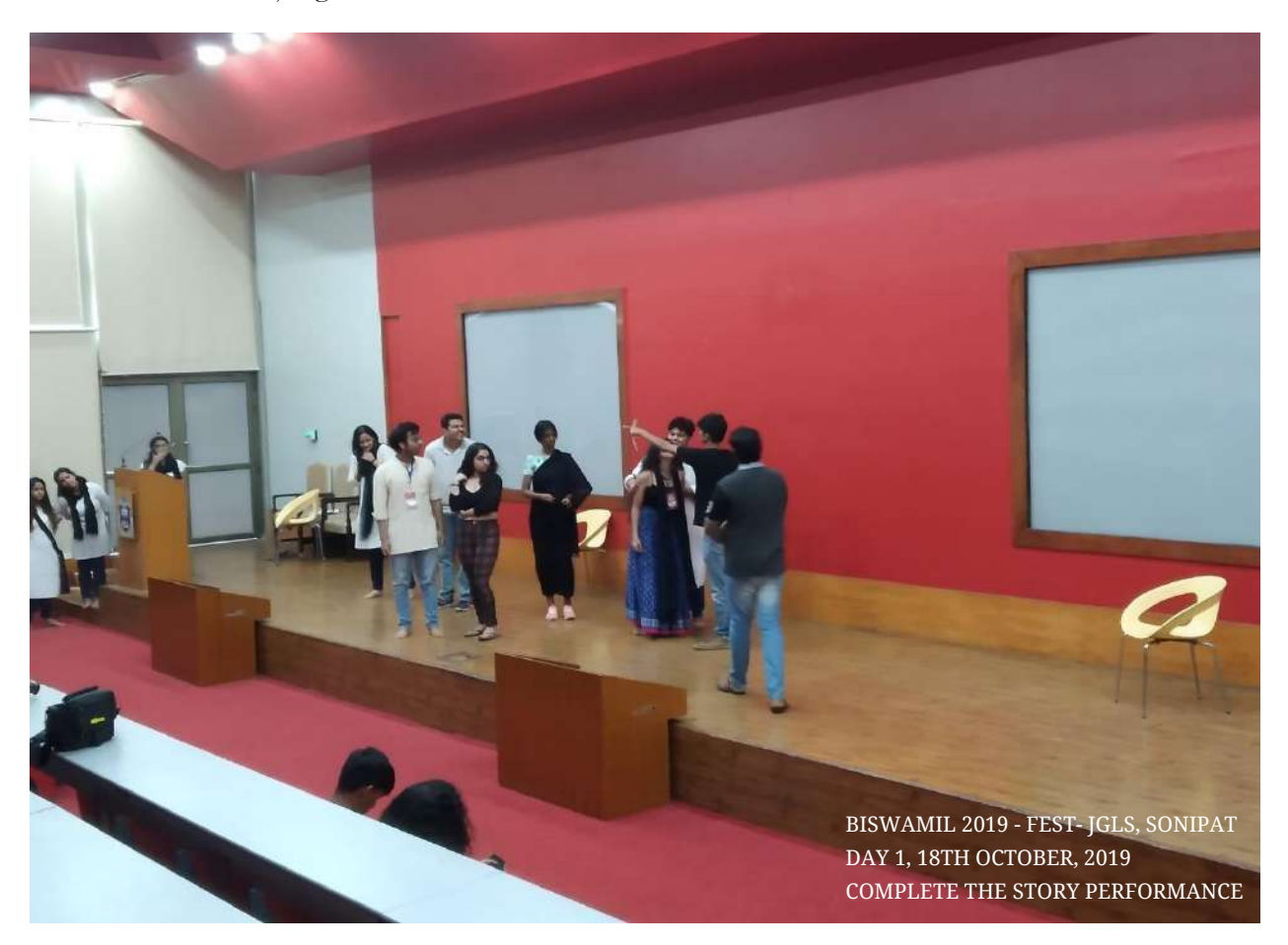
The 'Complete the Story' Performance

The location of the story was in a Mental Asylum, which made the act instant, intriguing and hilarious. SLS was adjudged as winners.