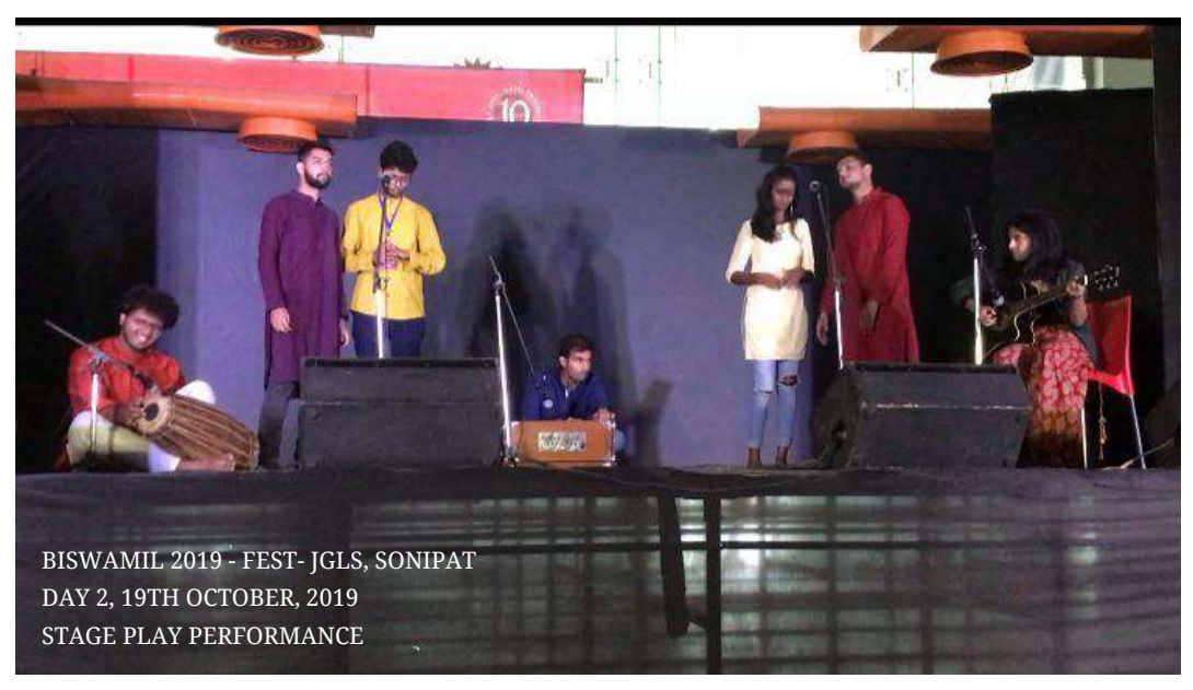
Team SLS Performing At Biswamil