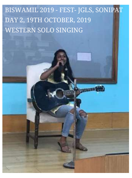
Surabhi performing at Western Solo Singing

Swathi Gopinath performing Titanium in the western solo event.